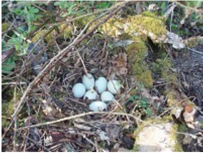
NRC No: 636, Mallard nest, 7 warm Eggs, 21/04/2010.