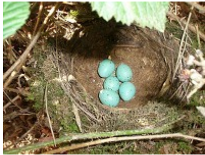
NRC No: 690, Song Thrush nest, 5 warm eggs, 14/05/2010.