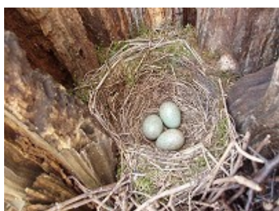
NRC No: 601, Blackbird nest, 3 warm eggs, 10/04/2010.