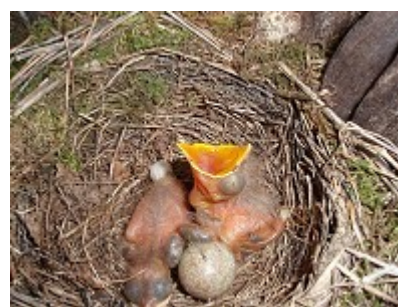
NRC No: 601, Blackbird nest, 2 young, naked/blind, 1 dead egg, 16/04/2010.