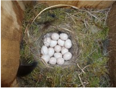
NRC No: 623, Blue Tit nest, 15 warm eggs, 14/05/2010.