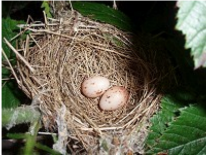
NRC No: 711, Blackcap Nest, 2 warm 'erythristic' eggs, 23/05/2010.