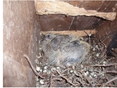
NRC No: 755, Stock Dove nest, 2 young, primaries less than 1/3 emerged, 12/09/2010.