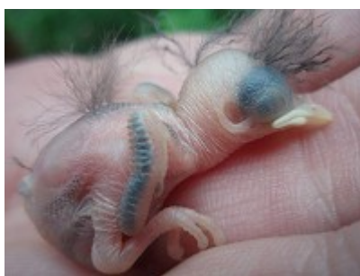
NRC No: 659, Wren nest, young, naked and blind, 31/05/2010.