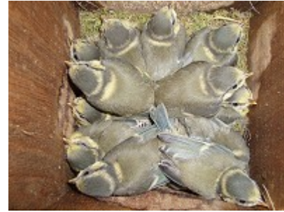
NRC No: 623, Blue Tit nest, 13+ young, primaries over 2/3 emerged, 05/06/2010.