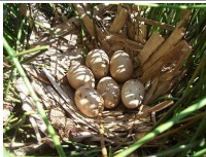
NRC No: 693, Moorhen nest, 6 warm eggs, 23/05/2010.