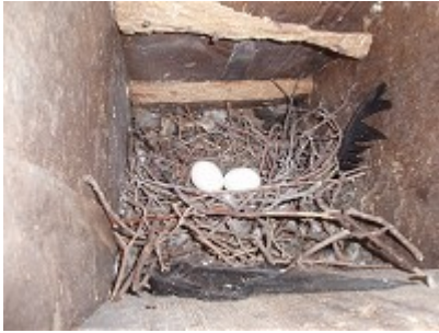
NRC No: 755, Stock Dove nest, 2 warm eggs, 30/08/2010.