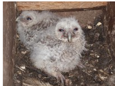
NRC No: 566, Tawny Owl nest, 2 young, primaries between 1/3 and 2/3