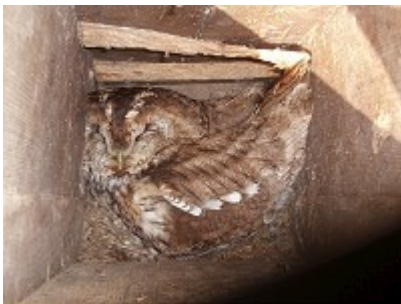
NRC No: 566, Tawny Owl nest, adult sitting on 2? warm eggs, 27/03/2010. emerged, 09/05/2010.