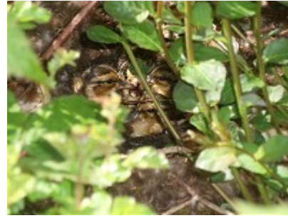
NRC No: 636, Mallard nest, 6+ young, 23/05/2010.