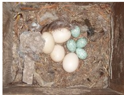
NRC Nos: 639/605, Jackdaw/Mandarin combined nest, 8 warm eggs, 21/04/2010.