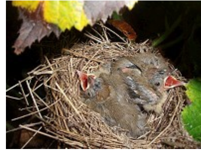
NRC No: 711, Blackcap Nest, 2 young, primaries ½ emerged, 12/06/2010.